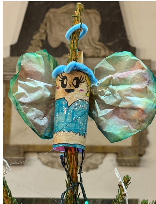
St Peter's Church, Broadstairs