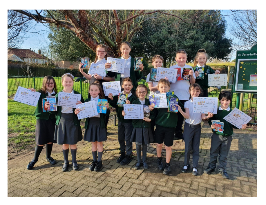
Winners of Storytelling week competitions.